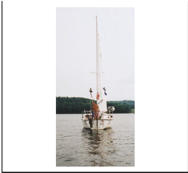
Top of page